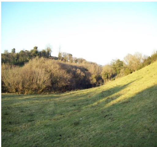
Views of the countryside